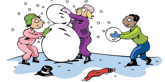
Youth Winter Retreat

The annual Winter Youth Retreat for all youth in grades 6-9 and their friends will be held on January 18-20, 2009. We will leave Lakeview at 5:30 pm on Friday and travel to the Green Lake Conference Center. EAT BEFORE YOU COME TO CHURCH. We will be staying in the Robbins Hall Dormitory and eating meals at the Kraft Dining Center. Each sleeping room includes 3 beds, bedding, pillows and towels. There is a bath/shower for every 2 sleeping rooms. Meals are served cafeteria style and are VERY generous. The program this year is entitled " Believe it?...or not. I believe. " We'll be having fun looking at what we believe and what it means in our lives as we use the words of the Apostle's Creed. On Saturday afternoon everyone will